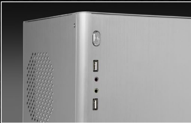
Front I/O: 2x USB2.0, 2x audio